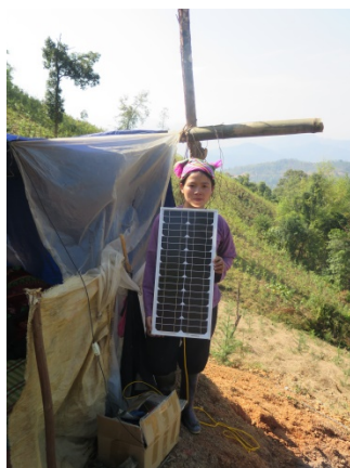
Photo 4: Solar electricity serving production in mountainous province

ADRA Has piloted and implemented successfully a Climate Smart Agriculture and Renewable Energy (CARE) project providing off-grid communities with access to sustainable energy using PV Solar, biogas, pico-hydro, and clean water using sand filters. CARE project is increasing and diversifying income of rural households but also reducing carbon footprint as a result of reduction of wood cutting, forestation and promotion of fuel efficient cook stoves which have resulted to reduce work load, time spend on domestic work and wood collection for women by 70%. The second phase of this project will work with the private sector to develop a market for renewable energy in Cao Bang province and continue to increase and diversify income for farmers by participating in lucrative value chains, and creating more jobs for women and youth entrepreneurs to enable uptake of such technologies by communities in the province.