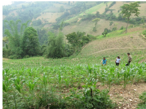
Photo 7: Climate Resilient Agriculture model – the Sloping Agricultural Land Technology piloted in Cao Bang